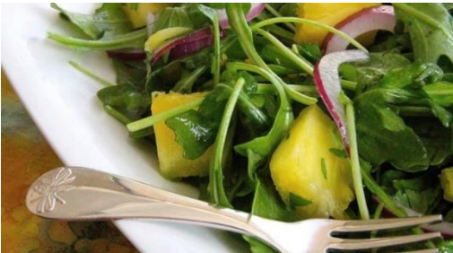
Pineapple Rocket Salad