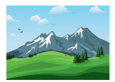
<u>April "HAPPENINGS"</u> Around N Georgia