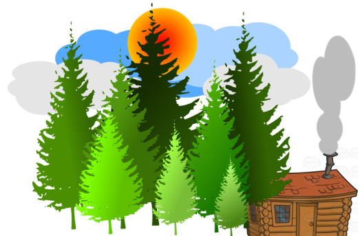
A LITTLE PIECE OF PARADISE!