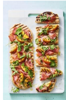
Peach and Prosciutto Flatbread