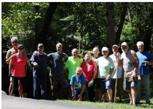
Cleaning the River of debris brought out lots of volunteers!!