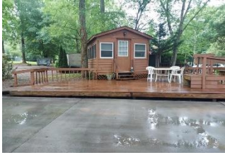
Sprucing up of Ms. Helen's place, looks wonderful!

The Front Entrance and Pump House, beautiful! The dedication of the Honor/Memory Wall will be July 3 rd , make plans to attend!!