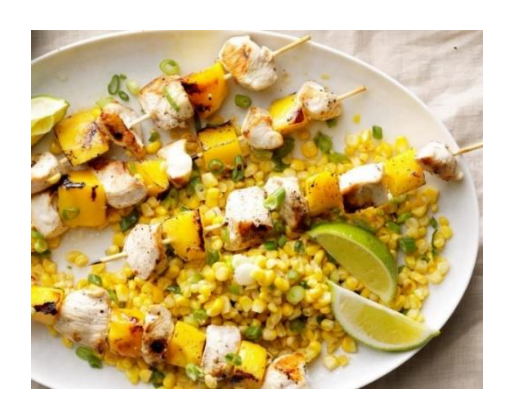
Grilled Chicken and Mango Skewers

WI-FI NETWORK NAME: WIN_902862 WI-FI NETWORK PASSWORD: 8ftvk53kb4